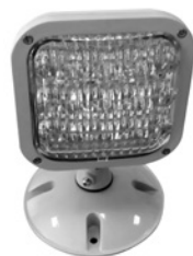
Single Lamp with Weatherproof (WP) Option