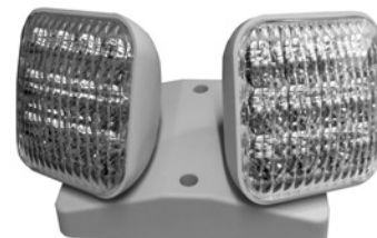
Double Lamp with No Options