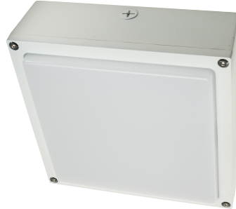
Flat Tempered Glass Lens